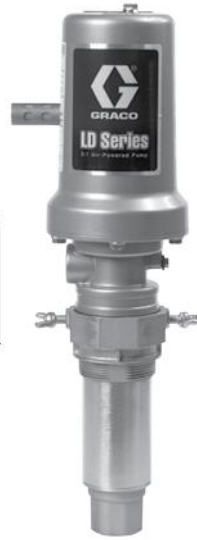
LD Series 3:1 Pump